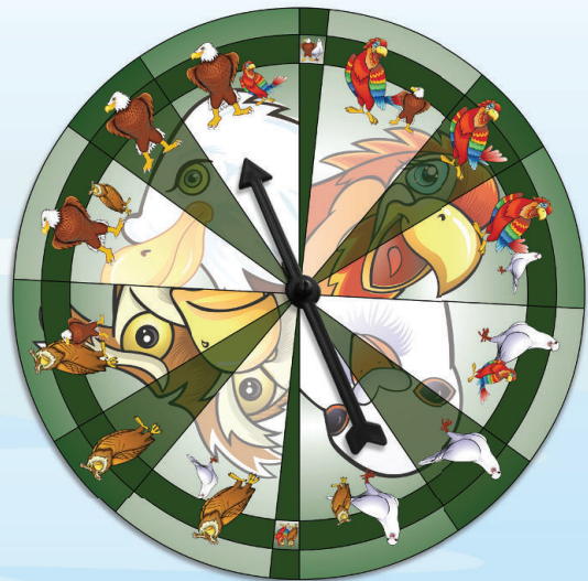
The Wheel of Style Exercise