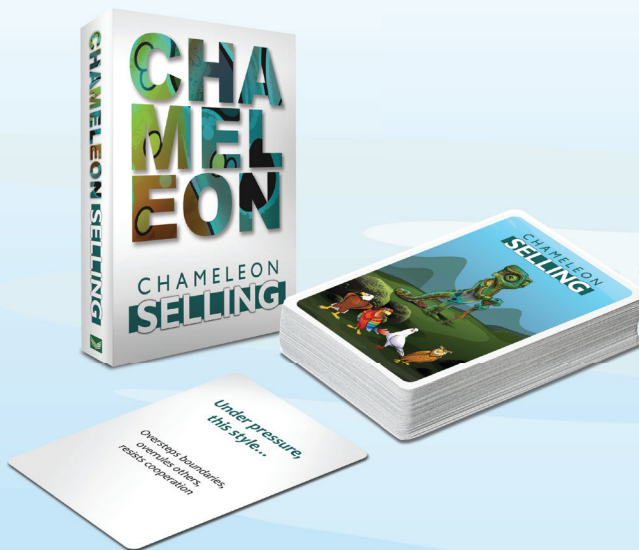
Chameleon Selling Style Card Exercise

Chameleon Selling engages sales professionals in a process that develops a better understanding of one's selling style, awareness of the styles of prospects and customers, improved communication skills, and a commitment to improve sales performance both as individuals and as a team.